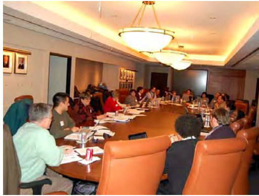
Executive Committee in session