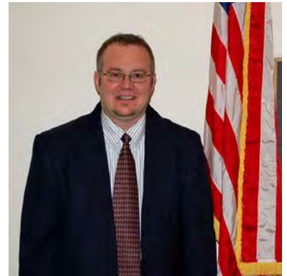
lore dickey