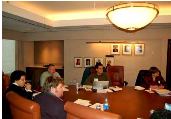
Executive Committee in session