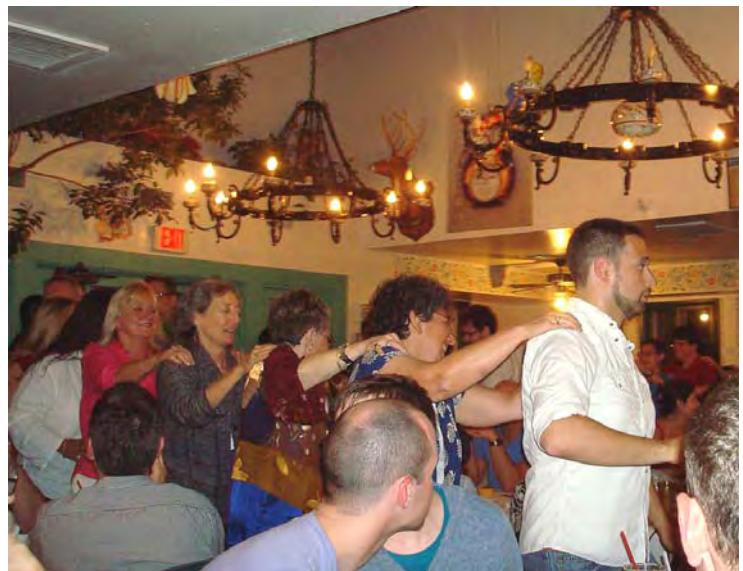
The conga line at the Annual Fundraising Dinner