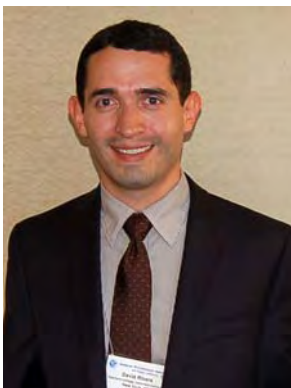
David P. Rivera Dr. Richard A. Rodriguez Student Travel Award