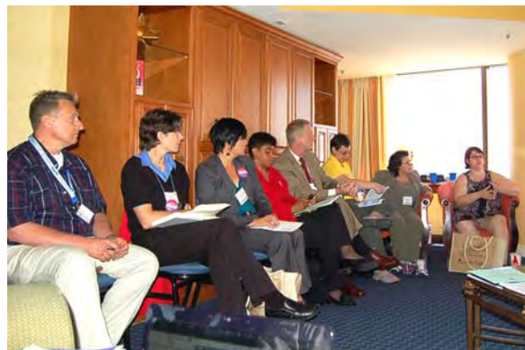
Division 44 Executive Committee Meeting