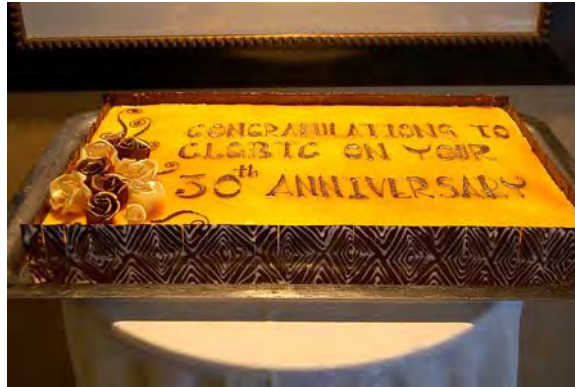
APA Committee on Lesbian, Gay, Bisexual, and Transgender Concerns (CLGBTC) 30 th Anniversary Cake